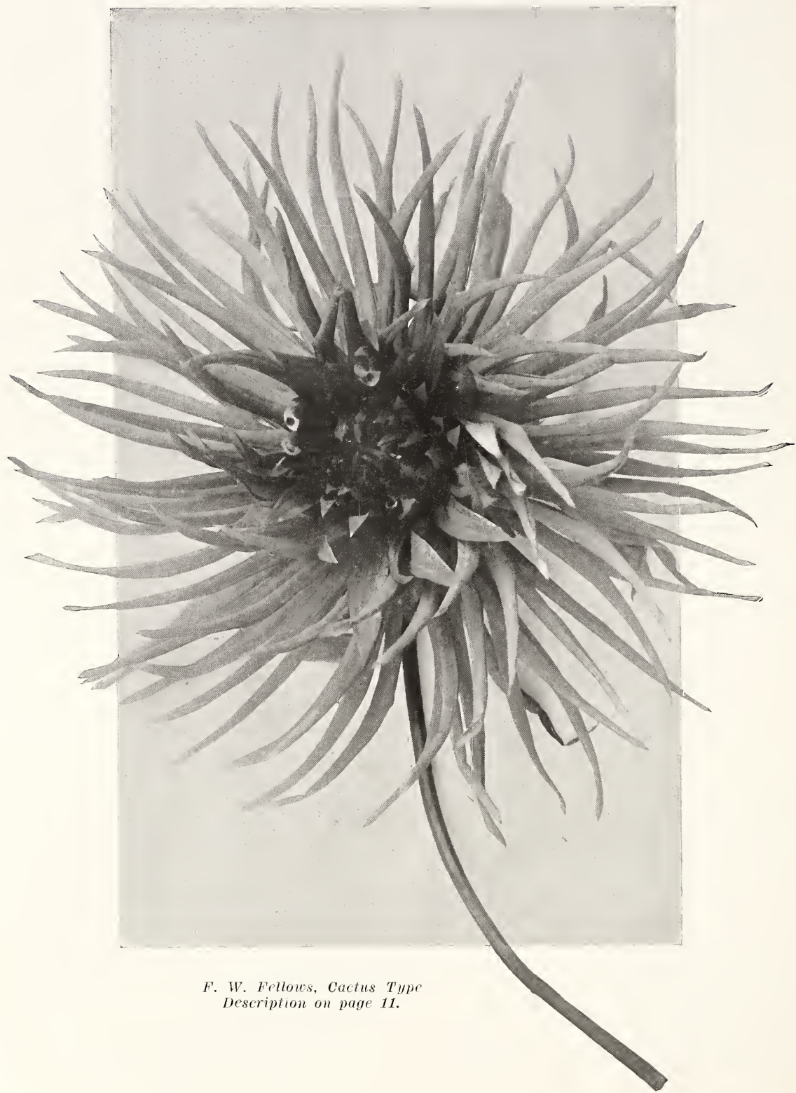
F. W. Fellows, Cactus Type Description on page 11.